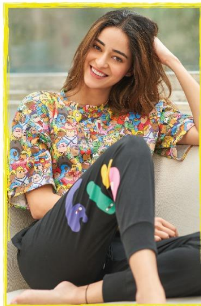
Graphic print Cropped T-shirt Style ID - 289029201 Price - ₹2299