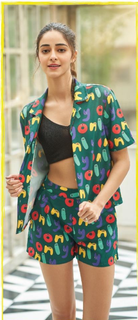
Graphic Print Resort Collar Shirt Style Id - 289028501 Price - ₹2299